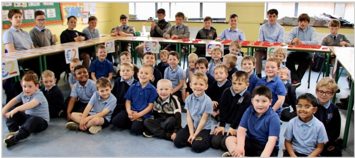
Some of our Junior Infants (2022/23) with Sixth Class boys (June 2023)