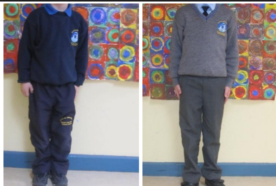
Tracksuit and uniform

To save loss of property, label all your child's belongings , e.g. coat, jumper, bag, lunchbox, tracksuit, etc.