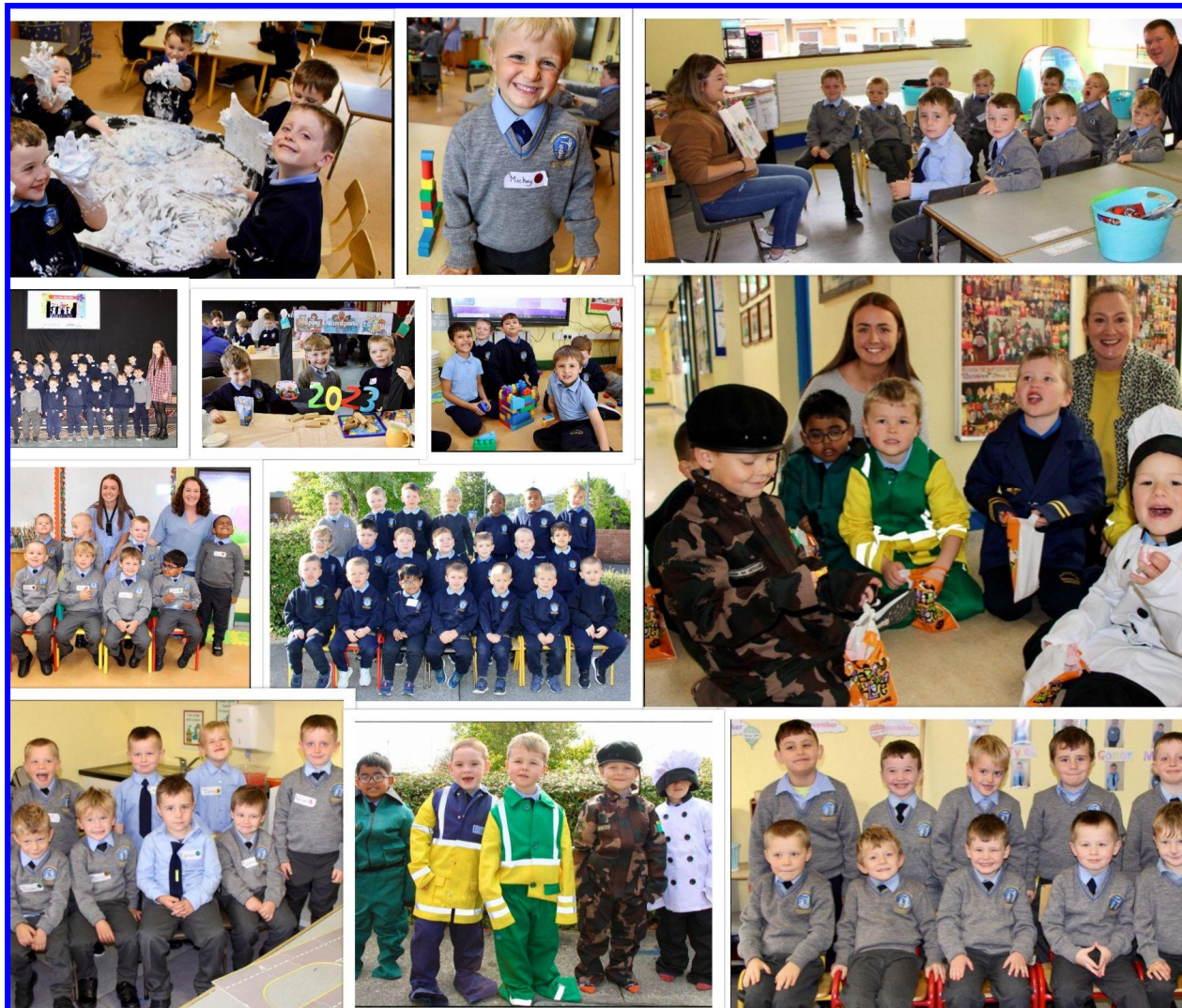
Some pictures of our Junior Infant Class 2022/23