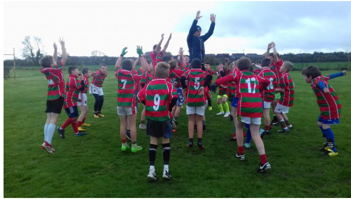
Reach for that ball

On 8 th November our U13 footballers played Tipperary CBS. This was a tough battle that ended in a draw. Unfortunately the replay did not fare out well for our boys. Well done on a fantastic performance.